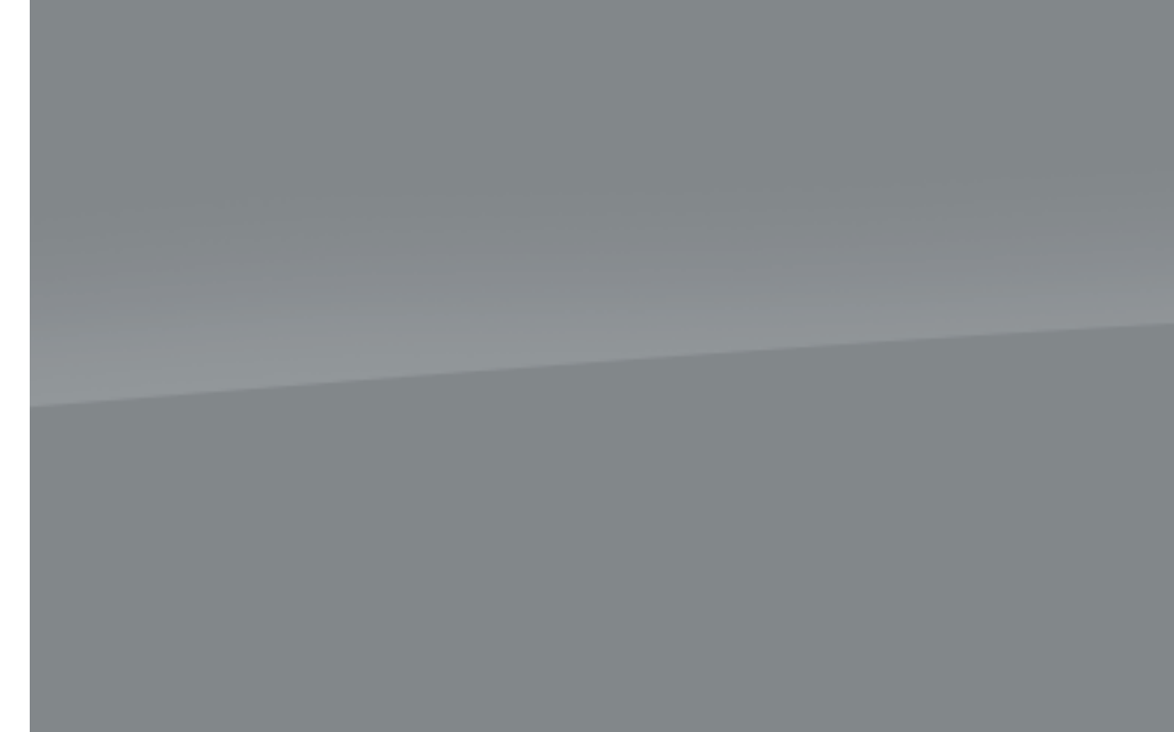
Quartz Silver (MOF4)** Two-coat metallic paint £650