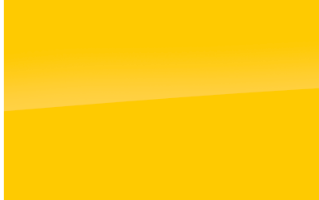
Post Yellow (E0DC)* Special colour £650

Available on Combo and Movano also as a special colour.