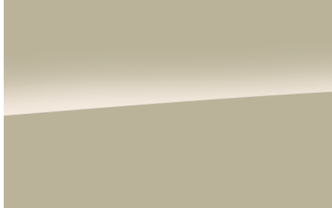
Tropic Beige (E0CC)* Special colour £650