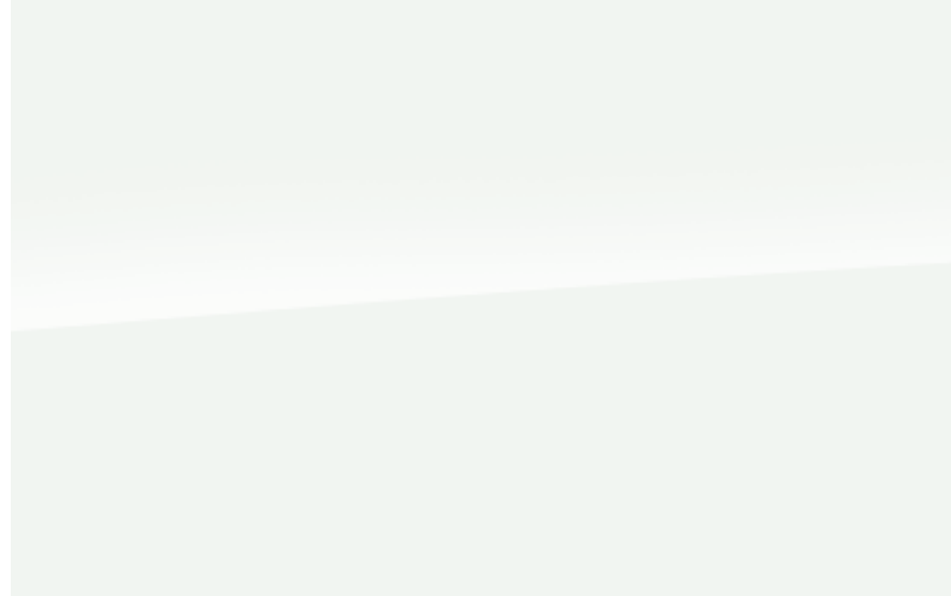
Kaolin White (POPR)* Solid paint