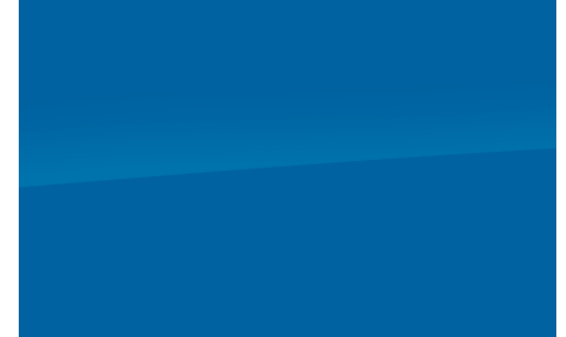
Power Blue (E0MG)* Special colour £650

Available on Combo and Movano also as a special colour.