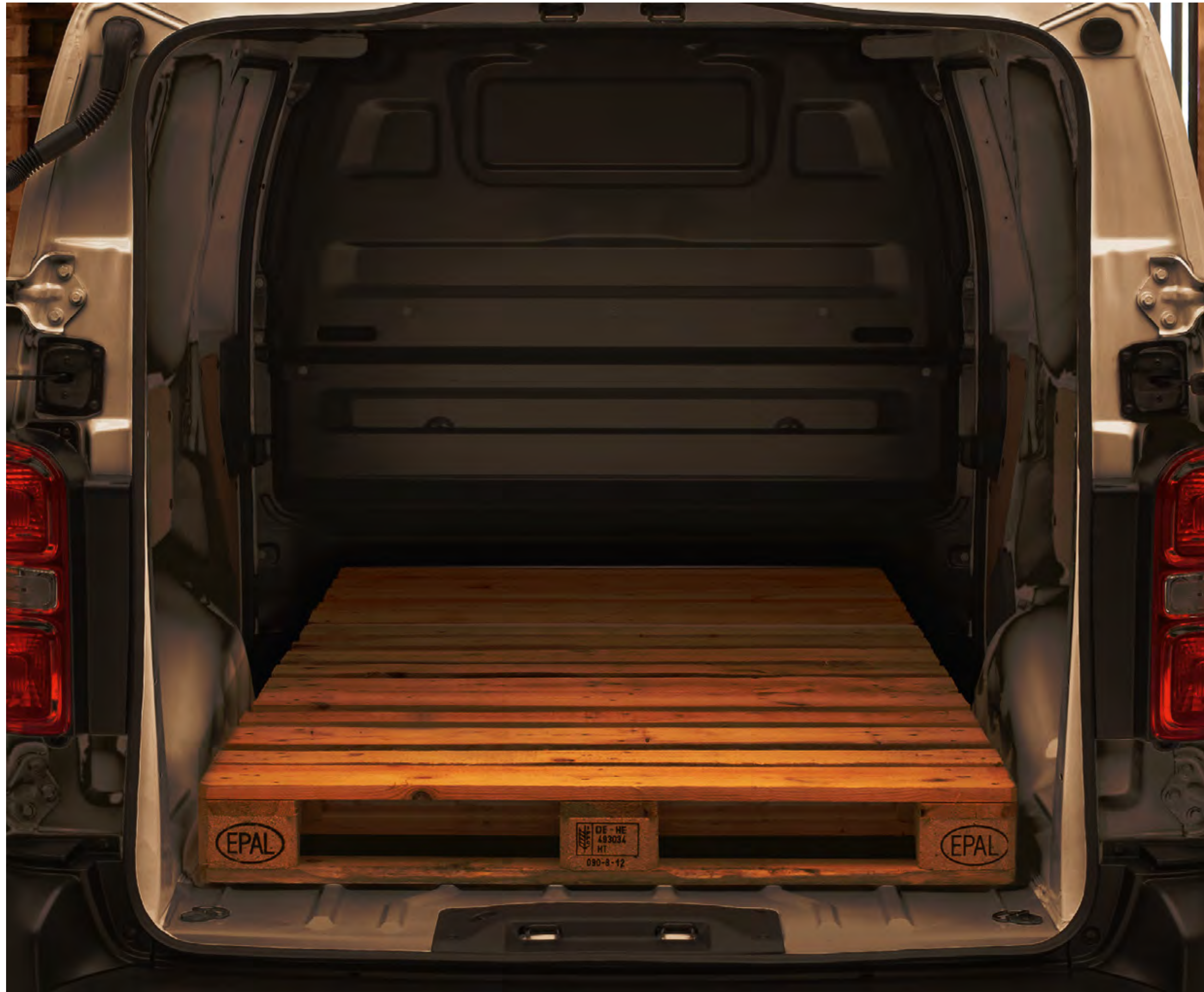
Full-height steel bulkhead.

Standard Features – The following features are standard across the entire Vivaro range.