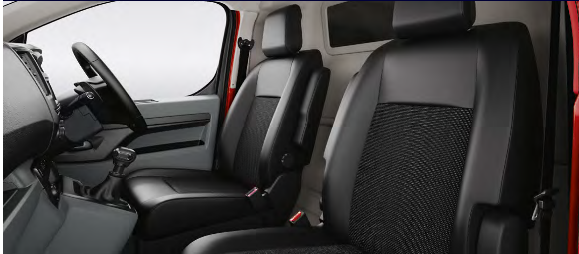
Prime/Pro Panel Van