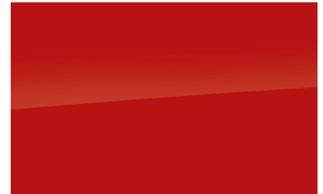
Ardent Red (E0X9)* Special colour £650

Available on Combo also as a special colour.