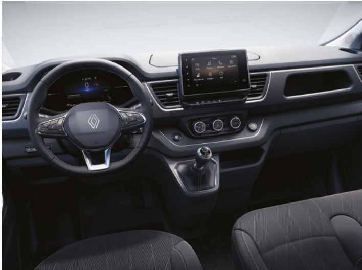
extra sport (extra +)