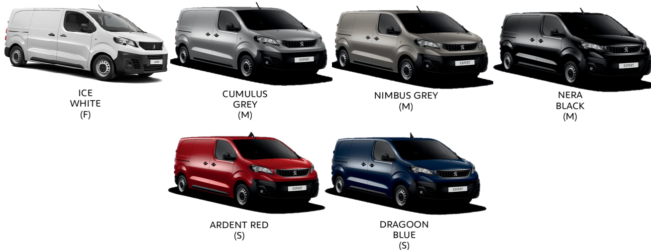
ICE WHITE (F)