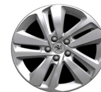
17" 'Phoenix' alloy wheel Option