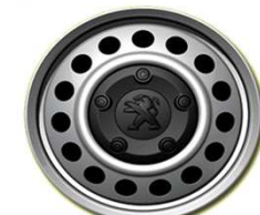
17" steel wheel with black centre cap