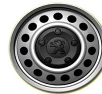
16" steel wheel with black centre cap