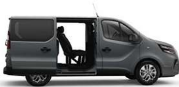
2 SLIDING DOORS