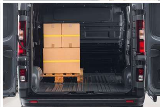
Side-hinged rear doors open 90 /180 /255 for unimpeded, 1.3M wide access