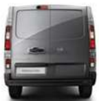
180 OR 270° PANELLED FRENCH DOORS