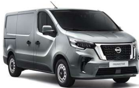
Highland Grey - M GHG