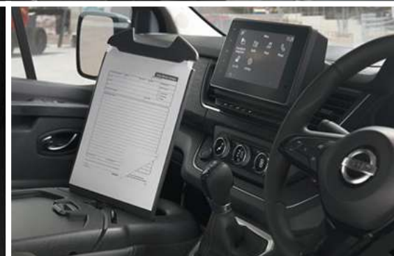
Mobile Office functionality*