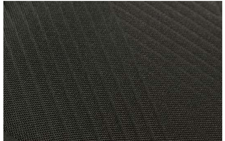
Blue - Dark Grey Standard on Tekna/Tekna+