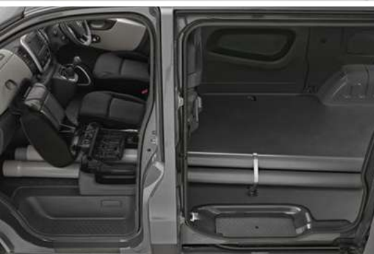
Sliding side door is over a metre wide, so will easily take a Europallet.