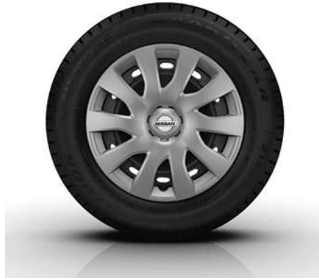
16" Wheel Cover Standard on Acenta grade