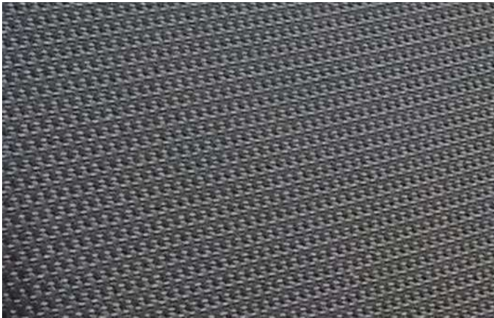
Grey - Dark Grey Standard on Visia/Acenta