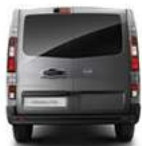
180 OR 270° GLAZED FRENCH DOORS