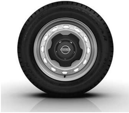
16" Steel wheel Standard on Visia grade