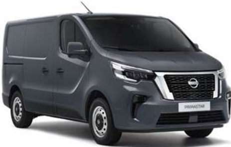
Urban Grey - S GRU