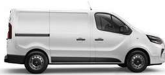
1 SLIDING DOOR