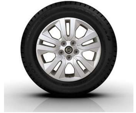
17" Alloy Wheel Standard on Tekna and Tekna+