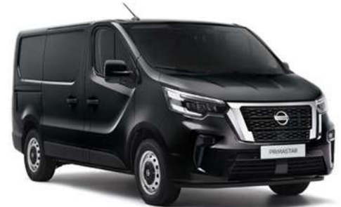
Jet Black - S BLK