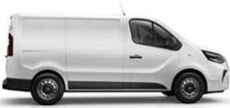
NO SLIDING DOOR