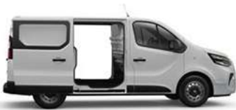
2 SLIDING DOORS