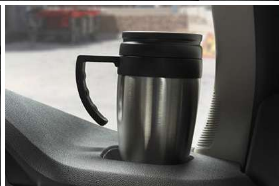
Convenient cup holder to safely hold your beverage*