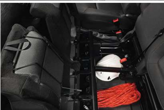
54 litres of storage beneath the passenger seats*