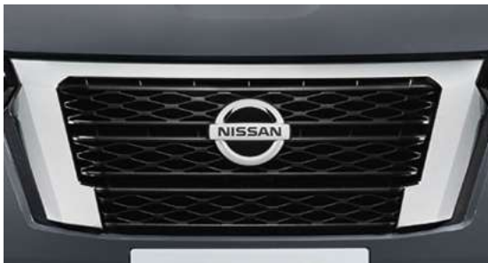
Distinctive Interlock-grille design