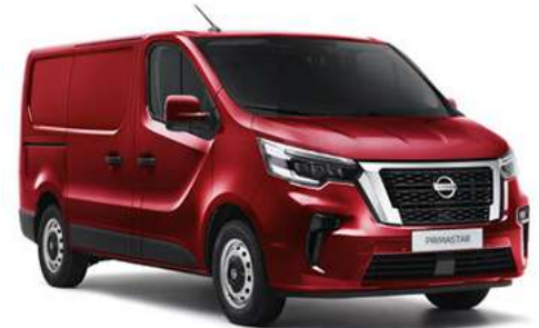
Carmin Red** - M RCM