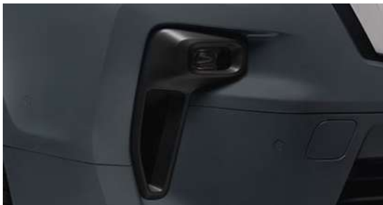
Side vents with LED fog lamps

Features available depending on version and grade, as standard or only as option (at an extra charge)