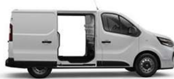
2 SLIDING DOORS