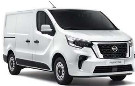
Glacier White - S WHI